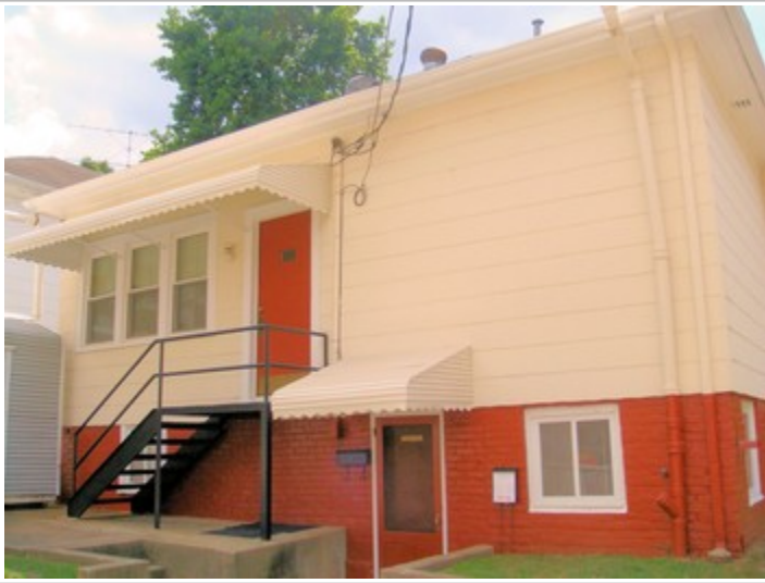
Close Up Of Private Rear Entry Door To Suite