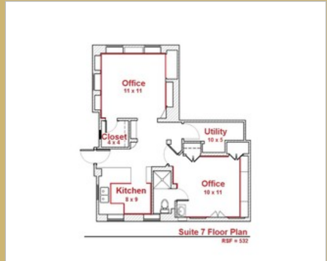
Exceptional 530 Sq. Ft. Executive Suites