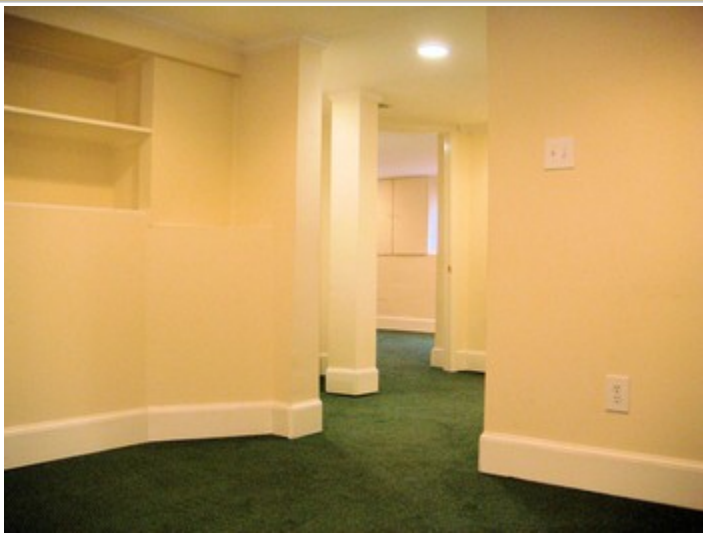
Ground Level View Of Archways to Both Offices