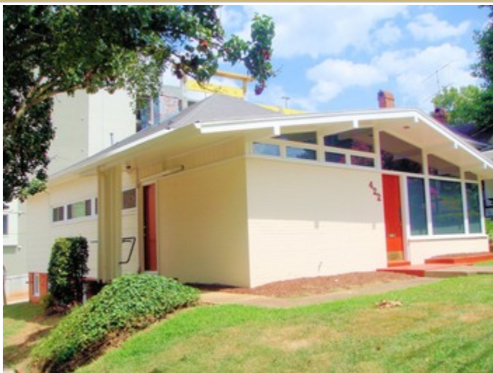
Front View Of Building On Saint Mary's Street