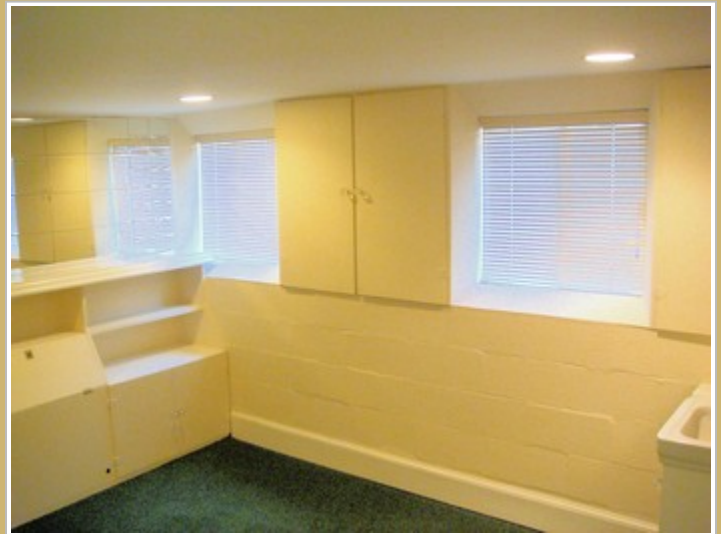
Outside Wall Of 1st Office With Track Lighting