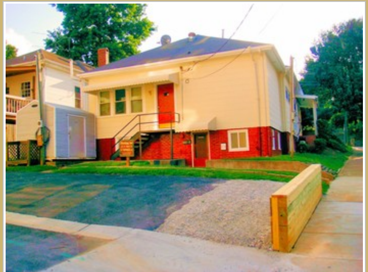
View Of Extended Rear Parking And Rear Entrance

PAUL JANSEN | 919-833-7142 | PJANSEN@JANSENPROPERTIES.COM