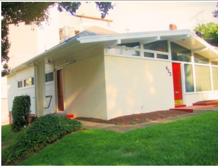
Front Left Corner Of Building On Saint Mar